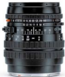
CFi 4/150 mm